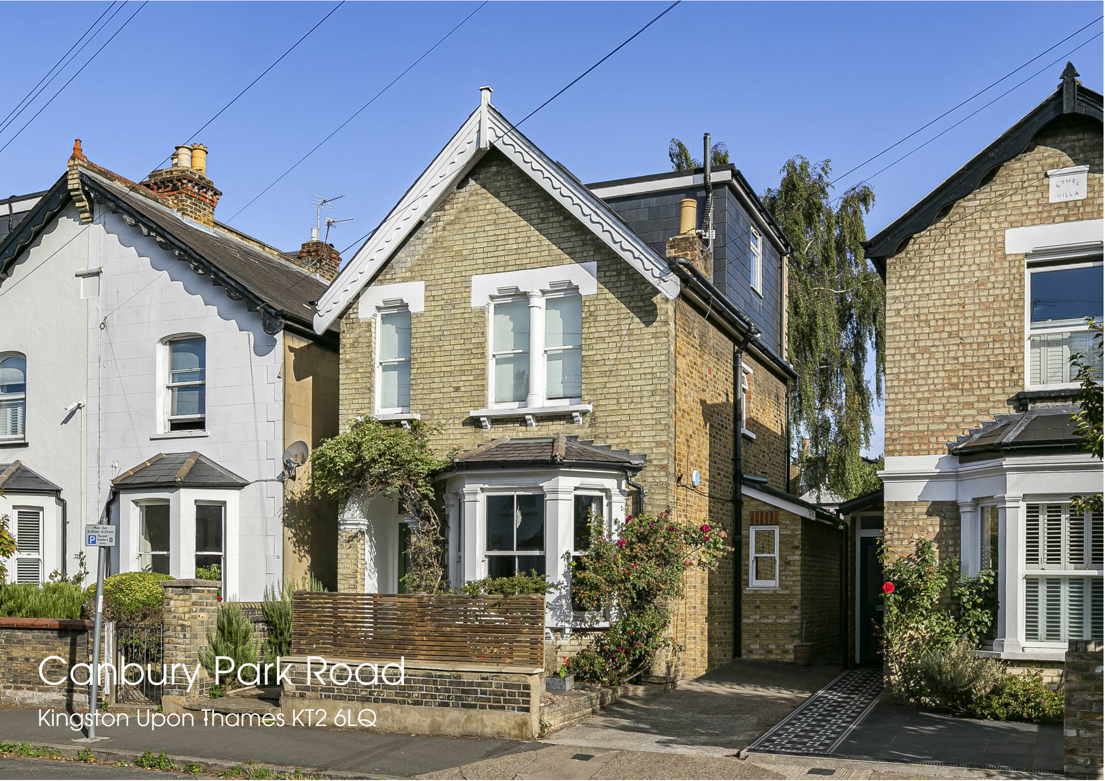
Canbury Park Road Kingston Upon Thames KT2 6LQ